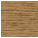
Natural Oak Veneer