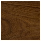
Natural Walnut Veneer