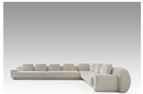
Image shows Natural Oak and Lucien Bone Z704/01