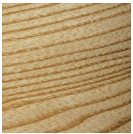
Natural Ash Veneer