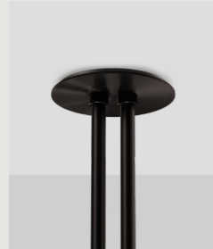
SLIM Ø14MM DOUBLE CANOPY CAN.SL.F14.XX-XXX

ALL ROSS GARDAM CEILING MOUNTED FIXTURES COME SUPPLIED WITH A CEILING CANOPY UNLESS OTHERWISE SPECIFIED. EACH CANOPY INCLUDES ELECTRICAL CONNECTORS, EARTH WIRE AND CABLE RETENTION TO CONNECT TO MAINS POWER. THE BELOW IMAGES DEPICT THE CEILING CANOPIES AVAILABLE WITH EACH FIXTURE TYPE. IF NO CANOPY IS SELECTED, THE SLIM CANOPY (NON US/CAN REGION) OR LARGE CANOPY (US/CAN) WILL BE SUPPLIED.