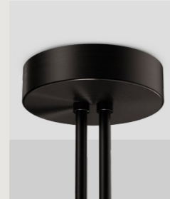
LARGE Ø14MM DOUBLE CANOPY CAN.ST.170.F14.XX-XXX

DRIVER HOUSED IN CEILING *US/CAN ORDERS TO BE INSTALLED WITH SUPPLIED JUNCTION BOX RENDR MOUNTING PLATE