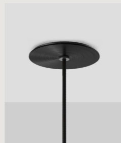
SLIM SINGLE PENDANT CANOPY CAN.SL.SP.X-XXX