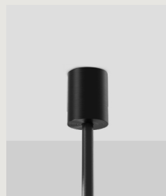
PUCK Ø14MM FIXED CANOPY CAN.PK.F14.X-XXX