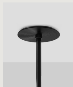
SLIM Ø14MM FIXED CANOPY CAN.SL.F14.X-XXX