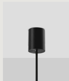
PUCK SINGLE PENDANT CANOPY CAN.PK.SP.X-XXX