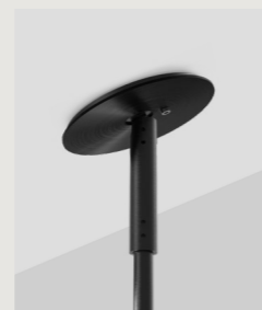
SLIM Ø14MM FIXED SWIVEL CANOPY CAN.SL.F14.SW.X-XXX