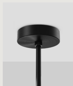
STANDARD Ø14MM FIXED CANOPY CAN.ST.120.F14.X-XXX