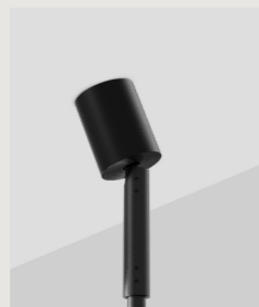
PUCK Ø14MM FIXED SWIVEL CANOPY CAN.PK.F14.SW.X-XXX