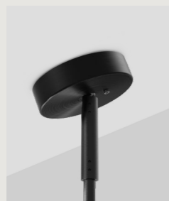
STANDARD Ø14MM FIXED SWIVEL CANOPY CAN.ST.120.F14.SW.X-XXX