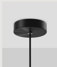
STANDARD SINGLE PENDANT CANOPY CAN.ST.120.SP.X-XXX