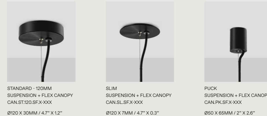
STANDARD - 120MM SUSPENSION + FLEX CANOPY CAN.ST.120.SF.X-XXX Ø120 X 30MM / 4.7" X 1.2" SLIM SUSPENSION + FLEX CANOPY CAN.SL.SF.X-XXX Ø120 X 7MM / 4.7" X 0.3" PUCK SUSPENSION + FLEX CANOPY CAN.PK.SF.X-XXX Ø50 X 65MM / 2" X 2.6"