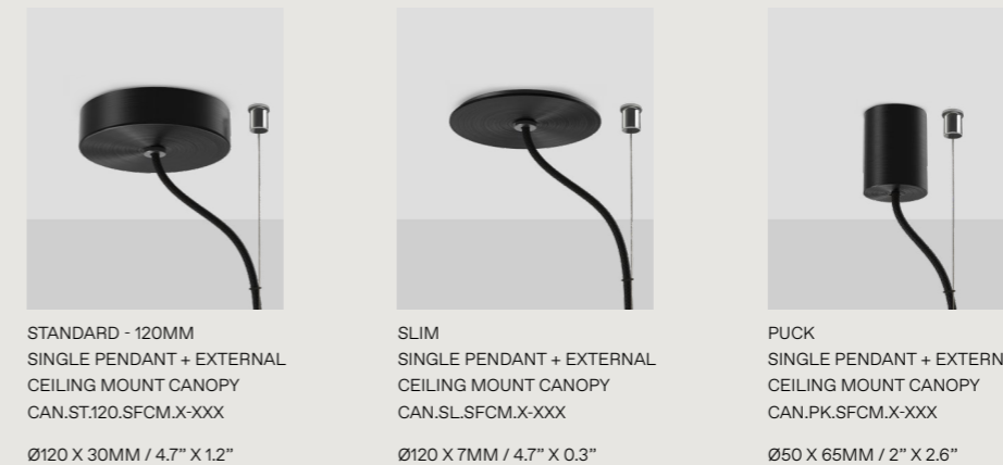
STANDARD - 120MM SINGLE PENDANT + EXTERNAL CEILING MOUNT CANOPY CAN.ST.120.SFCM.X-XXX Ø120 X 30MM / 4.7" X 1.2" SLIM SINGLE PENDANT + EXTERNAL CEILING MOUNT CANOPY CAN.SL.SFCM.X-XXX Ø120 X 7MM / 4.7" X 0.3" PUCK SINGLE PENDANT + EXTERNAL CEILING MOUNT CANOPY CAN.PK.SFCM.X-XXX Ø50 X 65MM / 2" X 2.6"