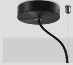
STANDARD - 120MM SINGLE PENDANT + EXTERNAL CEILING MOUNT CANOPY CAN.ST.120.SFCM.X-XXX