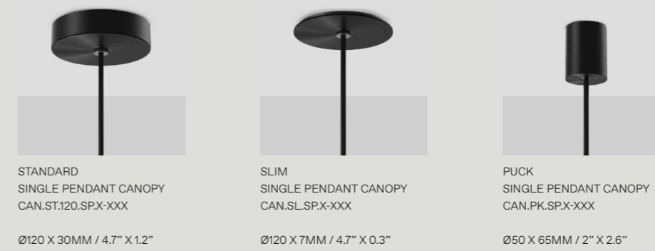
STANDARD SINGLE PENDANT CANOPIE CAN.ST.120.SP.X-XXX Ø120 X 30MM / 4.7" X 1.2" SLIM SINGLE PENDANT CANOPIE CAN.SL.SP.X-XXX Ø120 X 7MM / 4.7" X 0.3" PUCK SINGLE PENDANT CANOPIE CAN.PK.SP.X-XXX Ø50 X 65MM / 2" X 2.6"