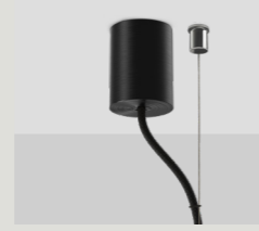
PUCK SINGLE PENDANT + EXTERNAL CEILING MOUNT CANOPY CAN.PK.SFCM.X-XXX