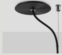
SLIM SINGLE PENDANT + EXTERNAL CEILING MOUNT CANOPY CAN.SL.SFCM.X-XXX