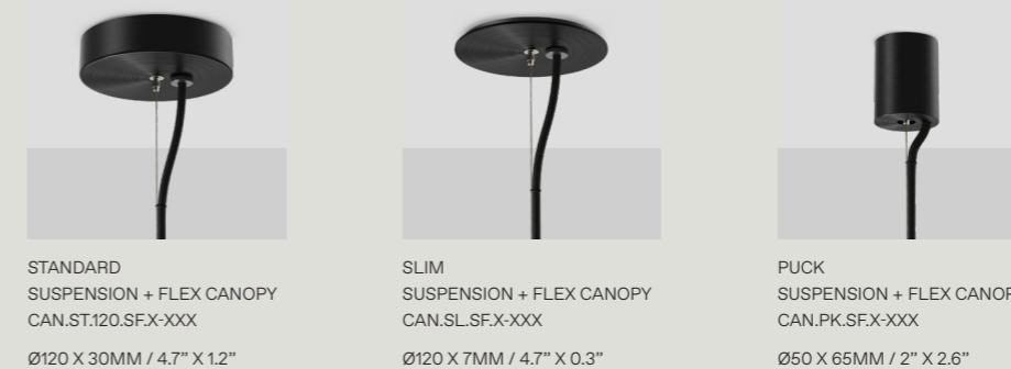
STANDARD SUSPENSION + FLEX CANOPIE CAN.ST.120.SF.X-XXX Ø120 X 30MM / 4.7" X 1.2" SLIM SUSPENSION + FLEX CANOPIE CAN.SL.SF.X-XXX Ø120 X 7MM / 4.7" X 0.3" PUCK SUSPENSION + FLEX CANOPIE CAN.PK.SF.X-XXX Ø50 X 65MM / 2" X 2.6"