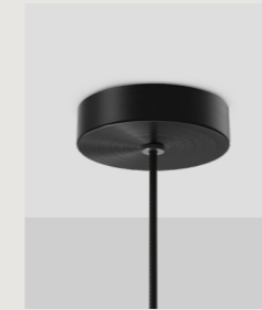
STANDARD SINGLE PENDANT CANOPY CAN.ST.120.SP.X-XXX