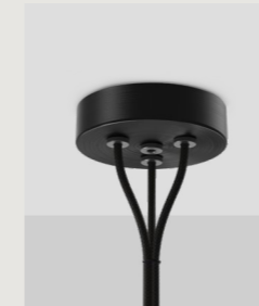
STANDARD CLUSTER PENDANT - 3 CAN.ST.120.CP3.X-XXX