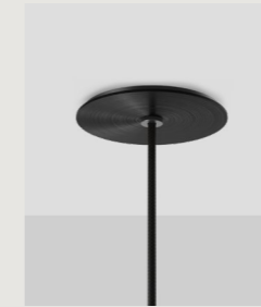
SLIM SINGLE PENDANT CANOPY CAN.SL.SP.X-XXX