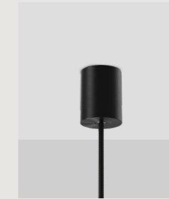
PUCK SINGLE PENDANT CANOPY CAN.PK.SP.X-XXX