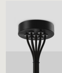
STANDARD CLUSTER PENDANT - 7 CAN.ST.CP7.X-XXX