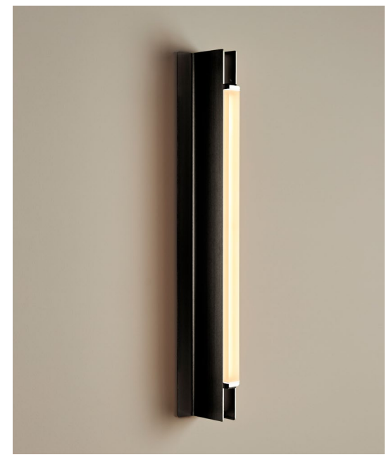
Beam 02 Sconce pictured with Anodized Black metal finish and Frosted lens