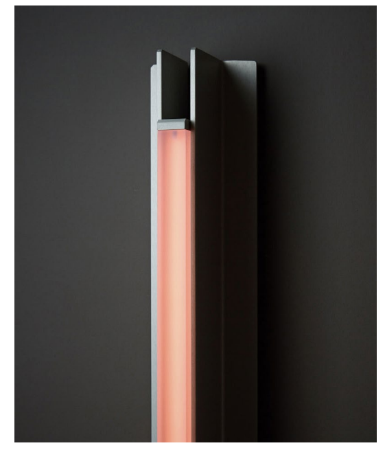
Detail of Anodized Silver metal finish and Rose lens