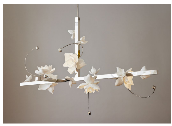
Custom Lure Chandelier 4 with Polished Nickel metal finish and White flowers