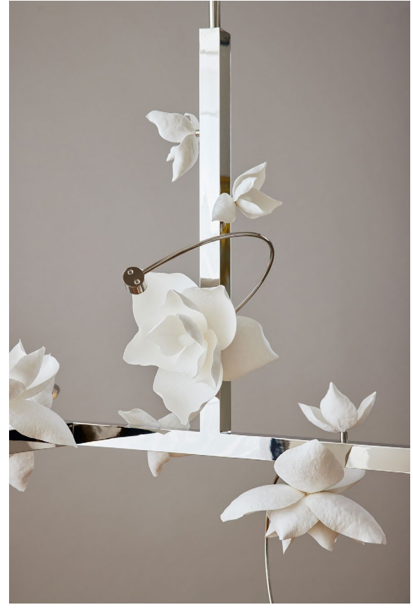
Lure Chandelier detail

The Lure Chandelier uses cast paper flowers that are sculpted by hand in our studio. Each blossom's petals are individually shaped and each Lure blossom is unique. Unlike wood-based paper, the cotton paper is archival in quality, extremely durable, and has been known to last for more than a hundred years.