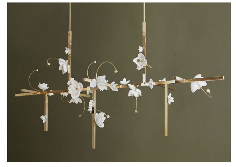
Lure Chandelier 12 with Polished Brass metal finish and White flowers