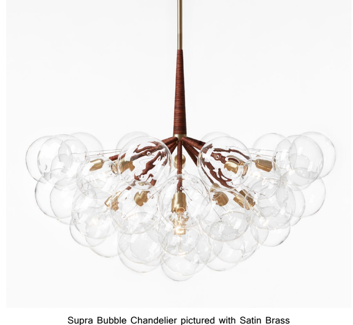
Supra Bubble Chandelier pictured with Satin Brass metal finish and Dark Brown Leather coiling