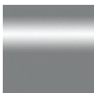
Mirror Polished Stainless Steel