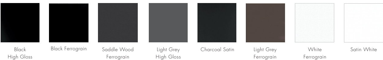
Black High Gloss