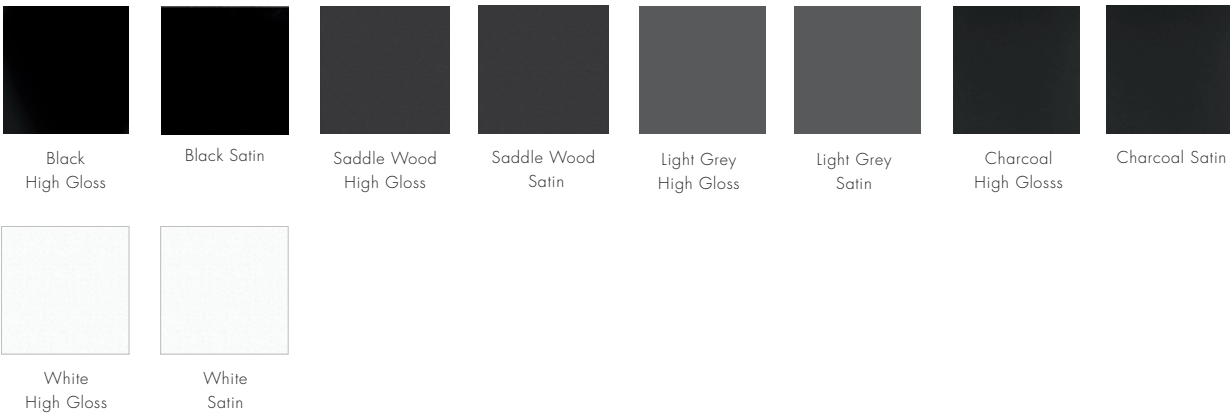
Black High Gloss