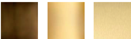
Brushed Oxidised Brass