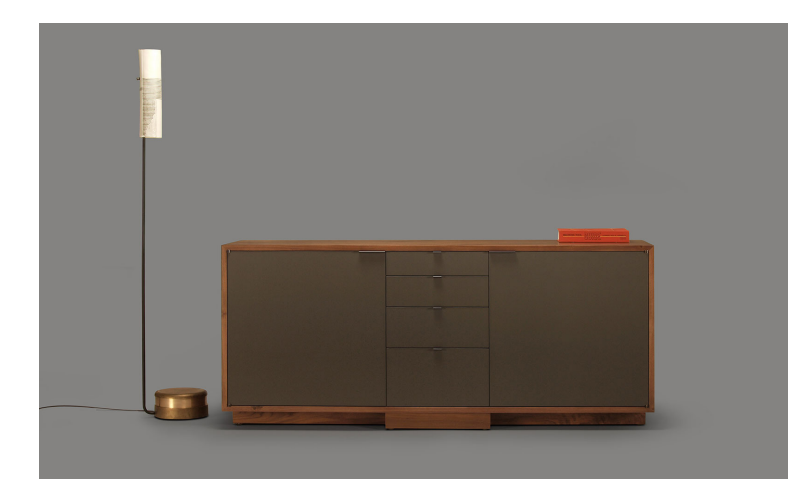
lineground server L39 / L40