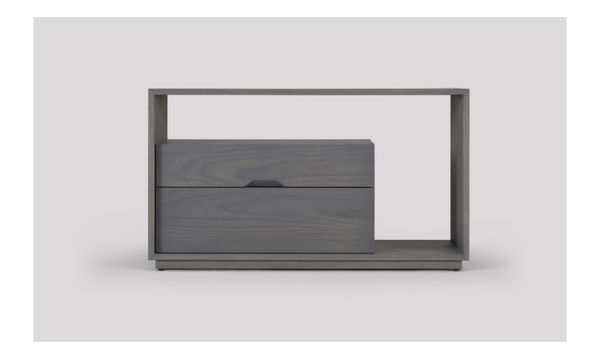
lineground side table/nightstand #1 L05 / L06